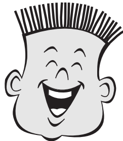
Gotta joke for ya!

Duane sends an E-mail from school to his friend in another school. In it, he repeats a joke containing rude language that he heard on a TV show.